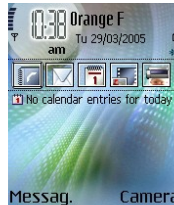
Phone main screen