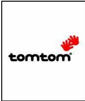
TOMTOM's start screen