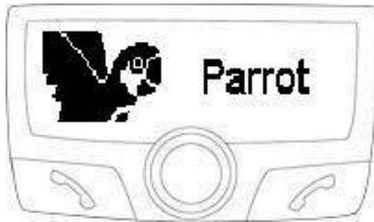
CK3300's start screen