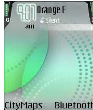
Phone main screen